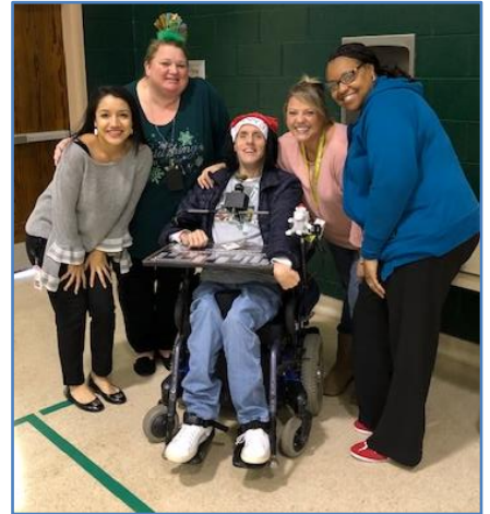
December Friendship Group